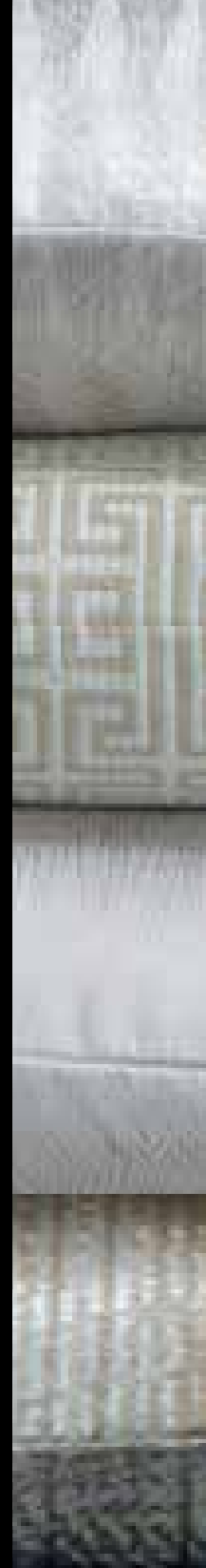
Curtain Magnetism CA1320