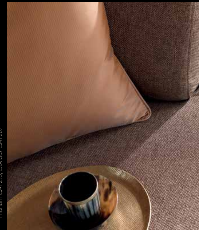
Thorium CA1295, Obvious CA1287