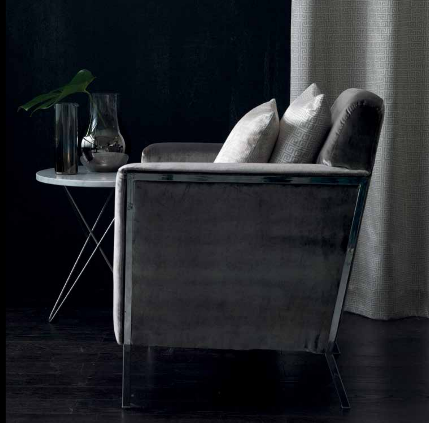
Palazzo Velvet, CA1175, Obscure CA1306, Offbeat CA1304