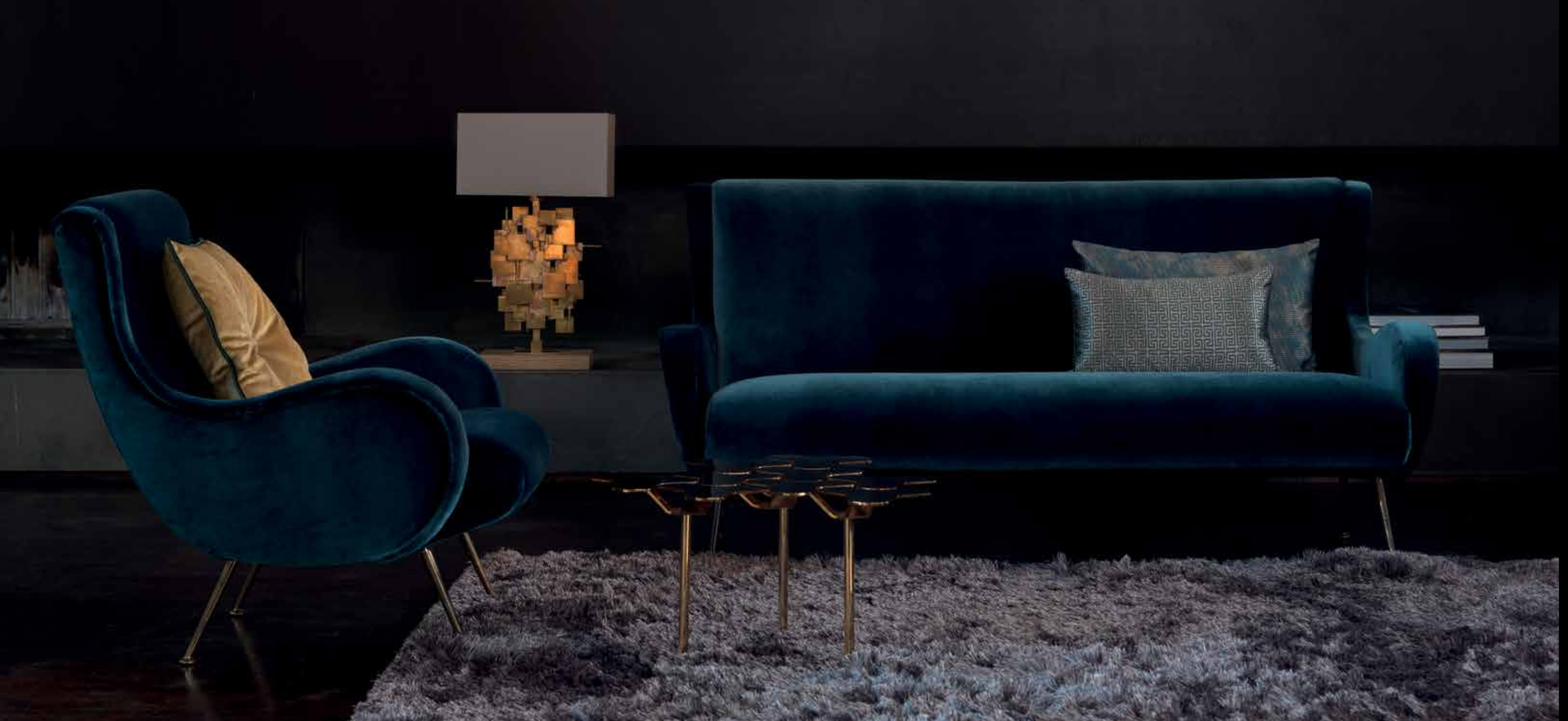
Palazzo Velvet CA1175, Pistoia Velvet CA1292, Obscure CA1306, Off Beat CA1304